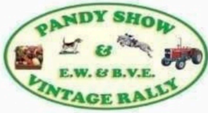
Exhibit Entry Form